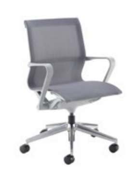
MEDIUM MESH Grey medium back operator chair Stocked in grey mesh