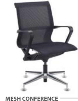
Black medium back visitor chair Stocked in black mesh