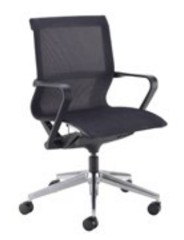
MEDIUM MESH Black medium back operator chair Stocked in black mesh