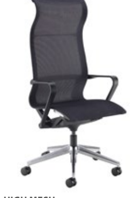
HIGH MESH High back operator chair Stocked in black mesh

HIGH MESH High back operator chair Stocked in grey mesh