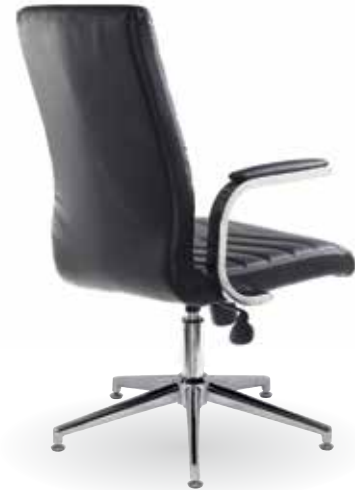
• Shown with optional glides