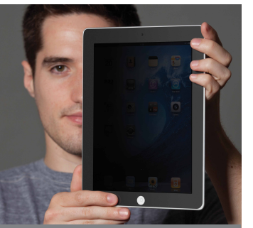
Tablet? Smart Phone?